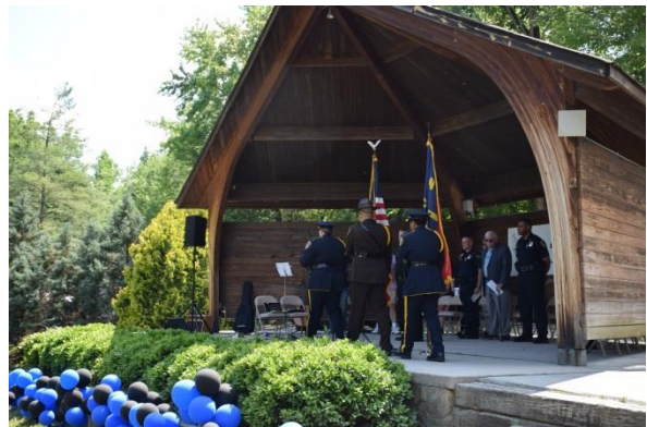
The Amphitheater at Lake Reidsville is used for many community events. On May 19, the Wives of the Blue Line held a Memorial Service for Fallen Officers, which included a balloon release.

This amphitheater has proven to be a real asset at Lake Reidsville, especially when July and the Independence Day Celebration rolls around. This year, the Independence Day event is planned for Saturday, July 6, 2019, from 3 p.m. to 10:30 p.m. This patriotic event is always popular and will be capped off this year with a performance by The Band of Oz